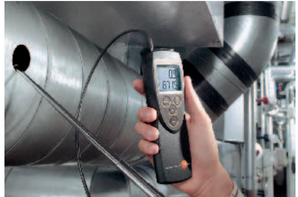
testo 425, e.g. for monitoring the volume flow of the exhaust air