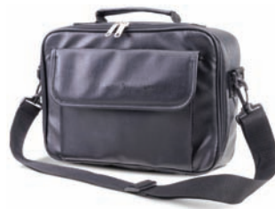
U5491A Soft carrying case