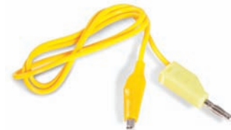
U5402A Yellow test lead for mA simulation

More accessories at: www.agilent.com/find/handheld-calibrator-meter