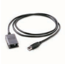
U5481A IR-to-USB cable