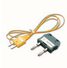
U1186A K-type thermocouple and adapter