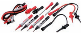
U1168A Standard test lead kit