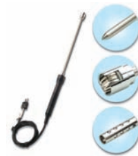
U1181A Immersion temperature probe U1182A Industrial surface temperature probe U1183A Air temperature probe