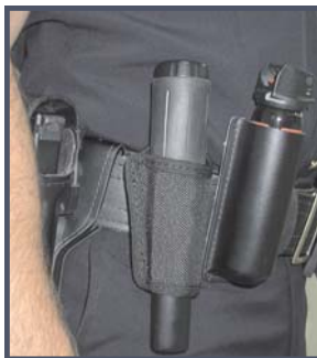
Ballistic weave holster (included) mounts easily on belt or in patrol car