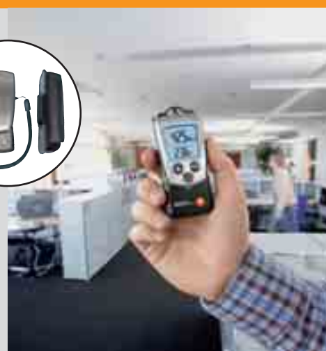
Monitors indoor air quality in office buildings

Included: belt case, wrist strap, protective cap and calibration protocol