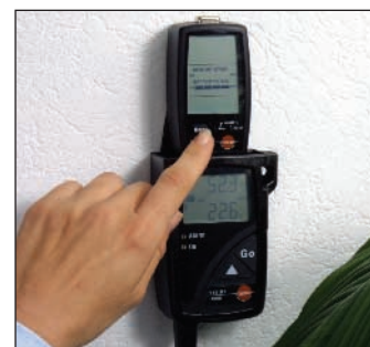
Collect data on-site with the testo 580 data collector, download and analyse on PC/Notebook.