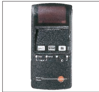
testo 575 fast printer, incl. 1 roll of thermal paper and batteries