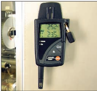
Wall holder, for quick attachment of logger to wall