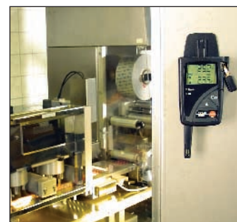
Efficient measurement of production and storage ambient conditions, to assure stable quality

Additional surface, immersion and air probes can be attached to the data logger e.g. for uninterrupted measurement of the dew point distance.